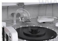
Reaction Tray 37±/0.1°C, water bath.