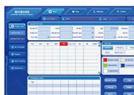
Software User-friendly software.