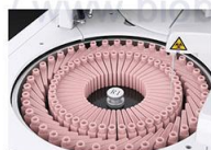
Reagent Tray 2~8°C cooling for 24 hours.