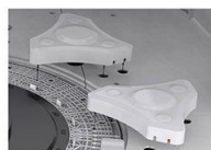
Mixer Probe Dual mixer, auto frequency adjustment.